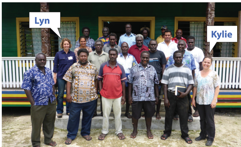
Choiseul Provincial Government workshop - Taro Island

Thank you again to everyone, particularly the Choiseul Provincial Government (CPG) and the Taro Island community, for making the trip a great success!