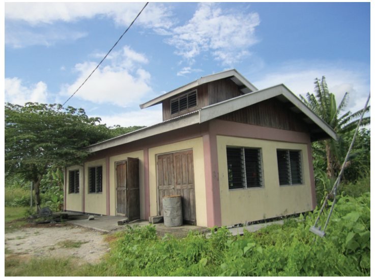
The Power House