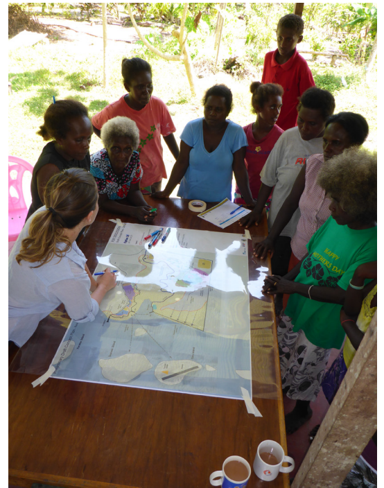
Talking to community members Supizae