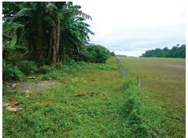
The Air Strip