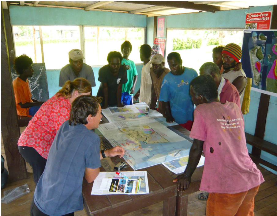
Talking to community members Poroporo

The feedback from the community and the CPG is given in the following pages.