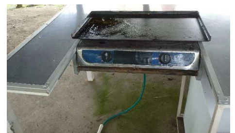
WAY FOR FUTURE: Biogas sanitation system creating energy from primary digester tanks to storage bags to BBQ oven. Located at the Samoa Cultural Village.