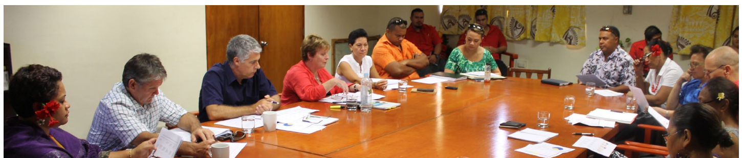
Mission Team presenting their preliminary findings to key tourism stakeholders at the Samoa Tourism Authority Board Room.