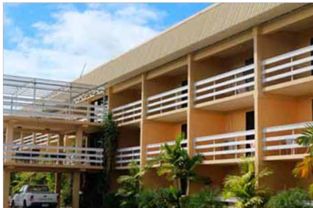
Insel Fehmarn Hotel is renovating to prepare for the upcoming All Blacks versus Manu Samoa match.

Renovations are underway at Apia's Insel Fehmarn Hotel, as the property readies itself for the upcoming historic test match between the All Blacks and Manu Samoa on the 8th of July 2015 at the Apia Park stadium.