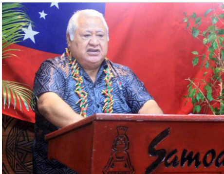
Prime Minister and Minister of Tourism, Hon. Tuilaepa Lupesoliai Dr. Sailele Malielegaoi delivering his address during the official opening of STE 2015.