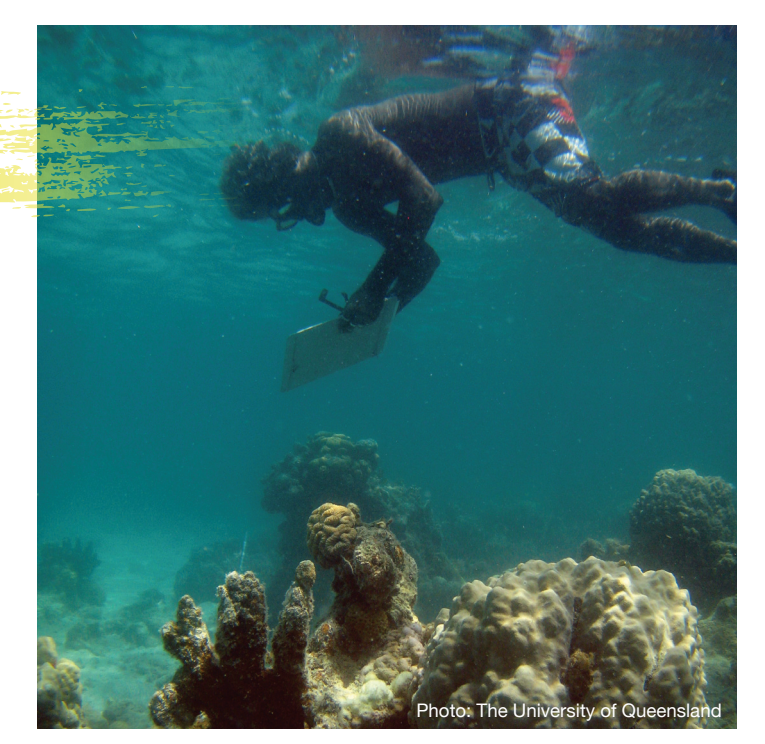
Threatened: Coral reefs protect coastal and marine biodiversity and provide habitat for a primary food source. Reef fish make up 60 per cent of marine food consumed in the Roviana region, and are an important source of protein.