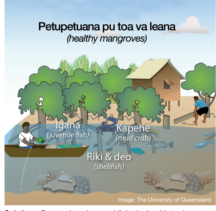
Solutions: Researchers have published a booklet using local language and illustrations to explain why and how the Roviana communities should protect their natural resources.