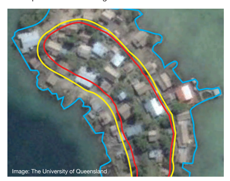
Illustrating: Overlaying sea-level rise data onto maps of the Roviana region allowed local communities to recognise how their homes may be impacted by climate change.

He developed a unique surveying tool that allows remote communities to calculate which areas of land will be flooded by sea-level rise. This will help people plan new developments and building relocations.