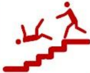
Teamwork & Collaboration