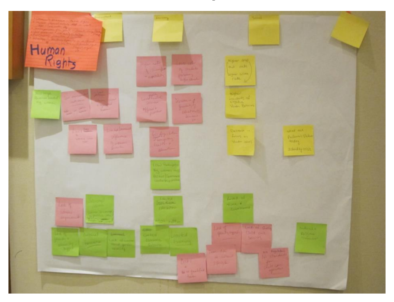
Annex 3 Photos of workshop activities