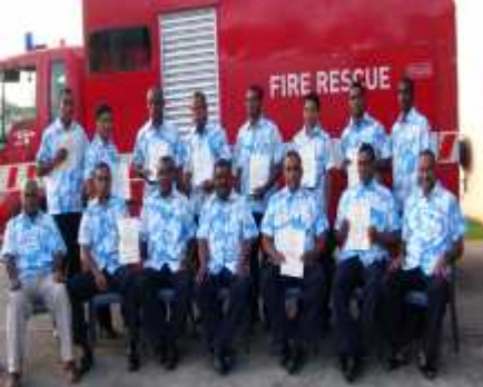
Firefighting course in Labasa.