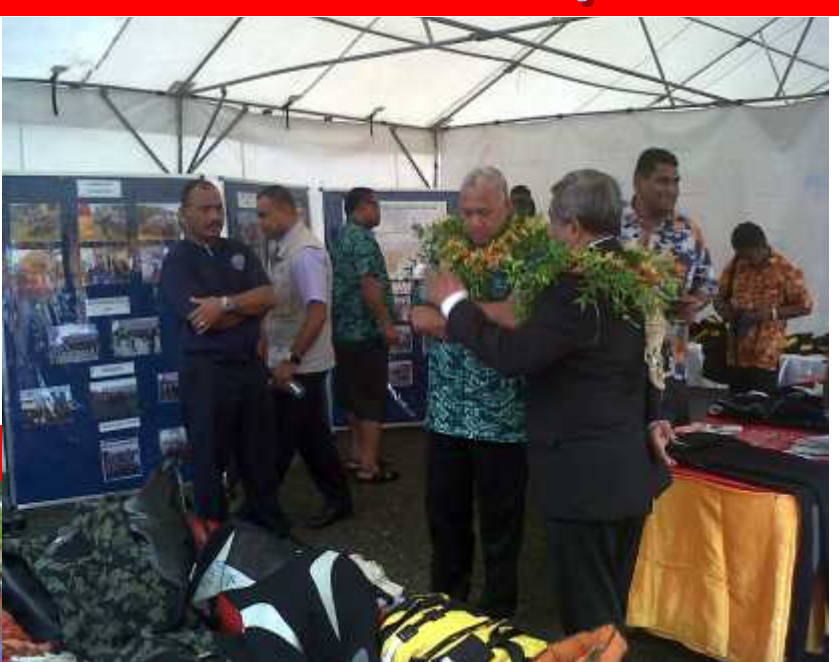
Prime Minister Commodore Voreqe Bainimarama at the NFA booth which was set up at the Suva Foreshore during the World Maritime Day Celebrations.

Firefighters performing the rescue drill.