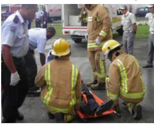
important to deliver the expected Instructor Level Training Drill during the final day of the one week course at the Suva Fire Station.