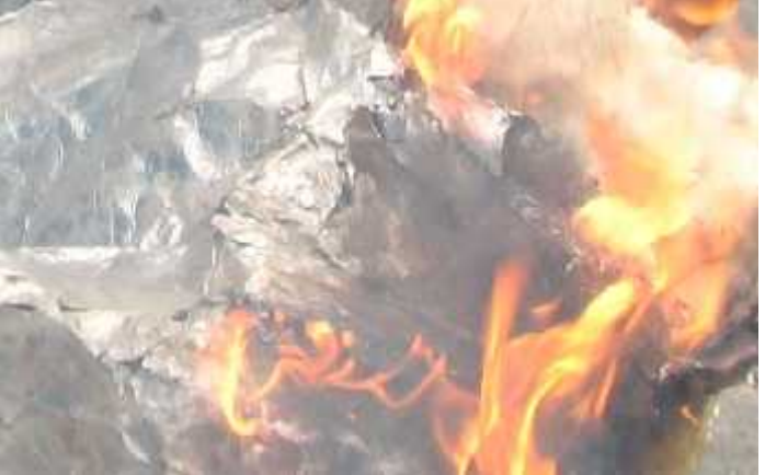
Fire spreads faster through sub-standard foil.