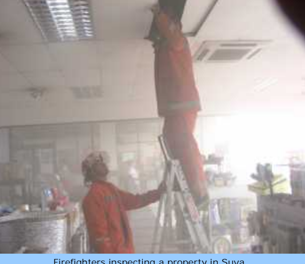
Firefighters inspecting a property in Suva.

and address any possible fire hazards that can lead to fires.