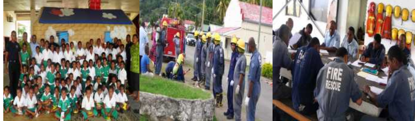
Smokehouse school visit to the Suva Fire Station.