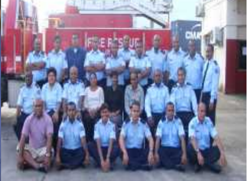
FICAC workshop for Central Division.