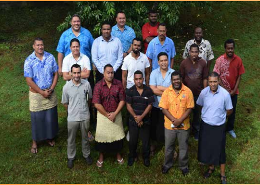
Participants of the SmartMET Training.