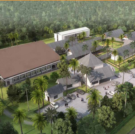
Proposed PCCC Design.