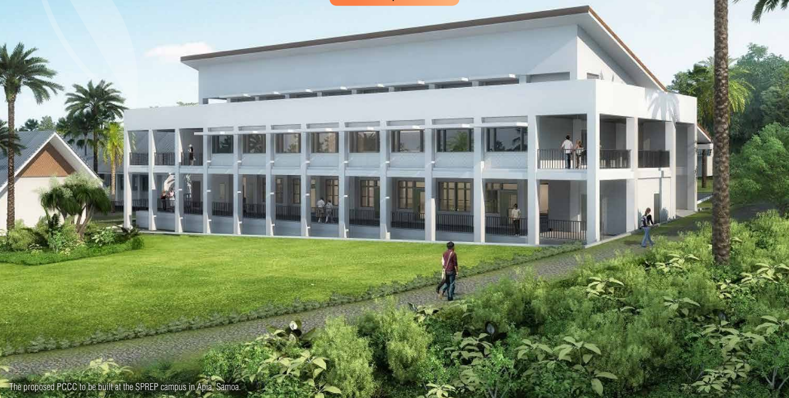
The proposed PCCC to be built at the SPREP campus in Apia, Samoa.