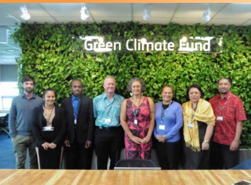
Pacific delegation.