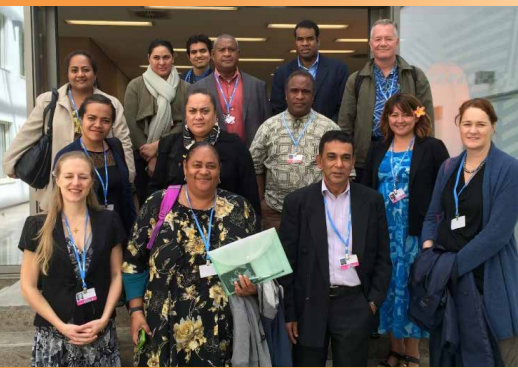
Some of the Pacific island delegates in Bonn for the United Nations Framework Convention on Climate Change subsidiary bodies meetings.