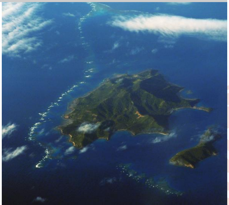
Lau Islands, Fiji