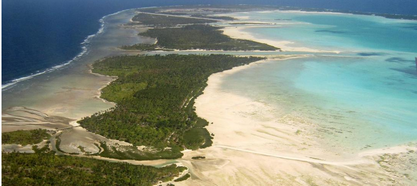
Tarawa atoll, Kiribati

For more information, contact your local meteorological service, or see the Island Climate Update at www.niwa.co.nz/climate/icu