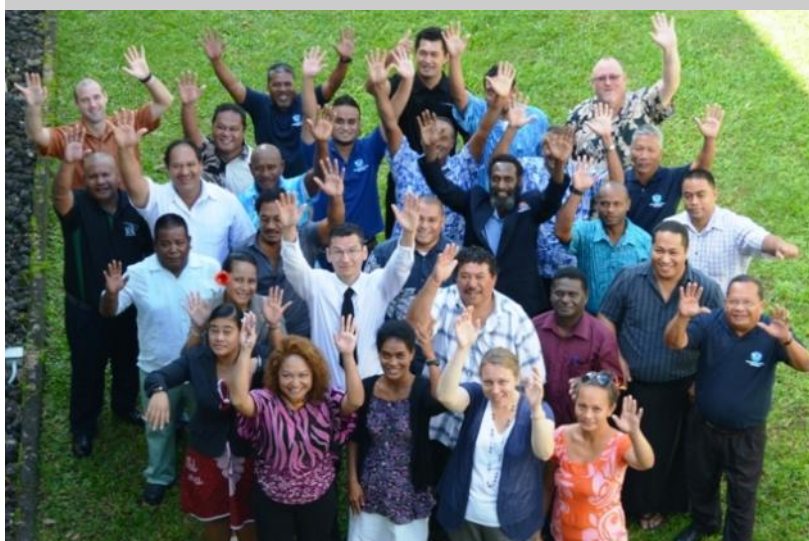
Workshop participants at SPREP

Under rules established by the International Civil Aviation Organization, all Meteorological Services must have a Quality Management System in place if they are providing weather information to the aviation industry.