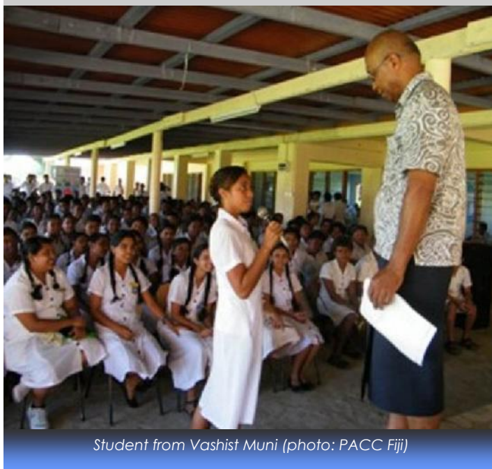
Student from Vashist Muni

Communities in two districts in Fiji are beginning to include climate change risks in their development plans, thanks to efforts by the Pacific Adaptation to Climate Change (PACC) Fiji project team and partners. Known as 'climate change mainstreaming', this is one of the key objectives of the PACC project and has been a focus for the Fiji team over recent months.