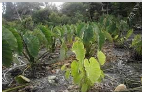
Taro crop