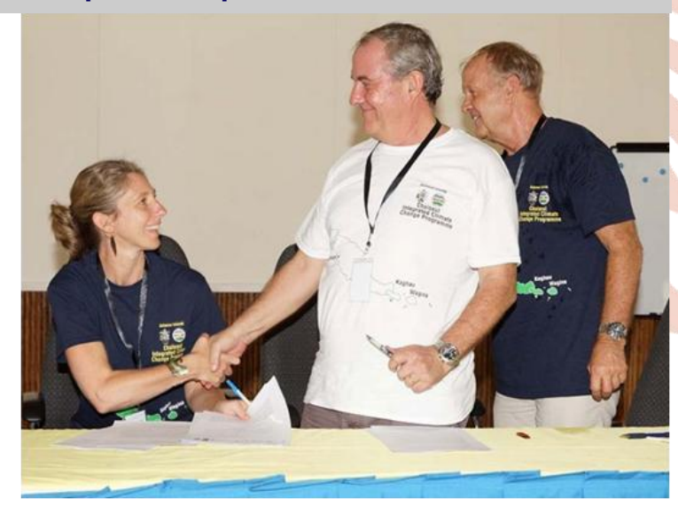
Handshakes upon signing of agreement

The Choiseul Integrated Climate Change Programme partners are: Secretariat of the Pacific Community; Secretariat of the Pacific Regional Environment Programme; Deutsche Gesellschaft Für Internationale Zusammenarbeit (GIZ); Pacific-Australia Climate Change Science and Adaptation Planning Programme; The Nature Conservancy, and the United Nations Development Program.