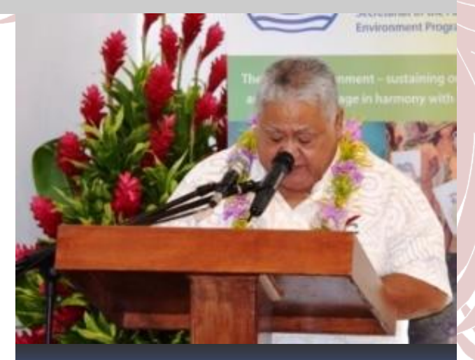
Hon. Tuilaepa Sailele Malielegaoi, Prime Minister of Samoa