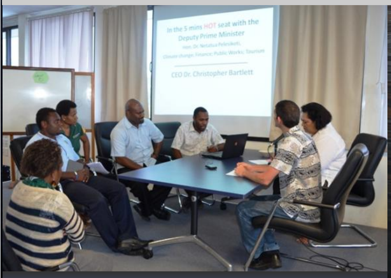
Role playing activity during the Negotiations training – participants had to prepare briefs and then verbally present these to the 'Deputy Prime Minister'

Vanuatu are preparing for the UNFCCC COP 19 in Warsaw, Poland with a range of different activities this year. One of which included a three day negotiations skills training for the 15 member delegation and other interested professionals held from 21 - 25 October, 2013.