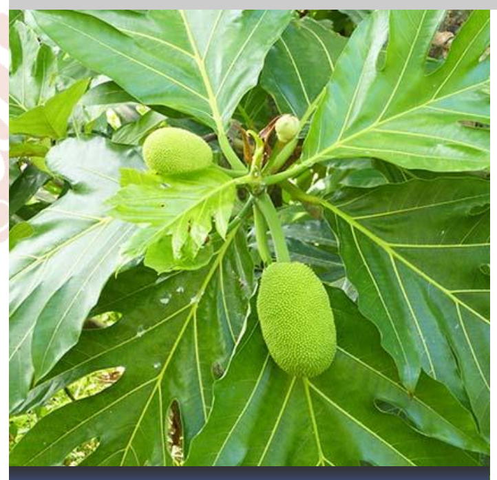
Breadfruit in Kiribati, an important local food that can be threatened by drought

The usual rainfall for this time of year is expected across the Pacific for the next three months.