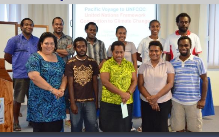
Media training

SPREP Media and Public Relations Officer