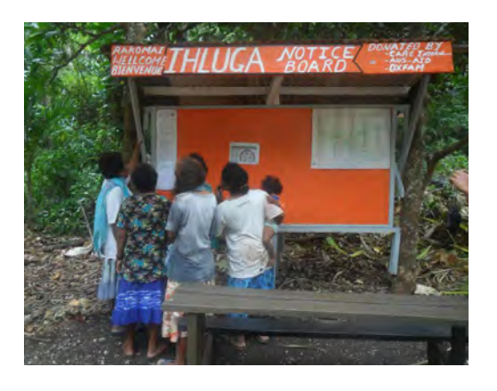
Ihuga community notice board, Herold bay Community, Futuna Island, Vanuatu.

While still under development, the website went live in early 2014 and has received extremely positive feedback from stakeholders such as government departments, the public and schools. Previously the information was available through email, workshop presentations and stakeholders visiting the KMS. Stakeholders have said that having this information available on the website is a lot more convenient, although they still very much appreciate the opportunity for face-to-face interaction with the KMS. We will continue to develop our website based on the development of our services and feedback from stakeholders. The link to the website is here <a href="https://www.met.gov.ki">www.met.gov.ki</a>.