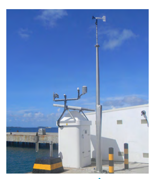
Tuvalu Tide Gauge, Funafuti.

Over the next six months, three meetings will be held around the Pacific to identify what sea level and oceans information, products and services stakeholders in the Pacific see significant benefit in having and using. Stakeholders at the meetings will be invited to share their knowledge, understanding and use of the current products and services available to them and provide significant input into the application and uptake of the COSPPac sea level and ocean services products, which include the soon-to-be-released ocean portal, the tidal calendars and real-time sea level display. Regional meetings will be held in Hawaii, New Zealand and Fiji in the coming months, with country workshops to follow in early 2015.