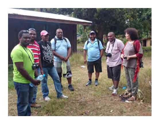
Stakeholders looking for typical mosquito larval habitats in North Guadalcanal.