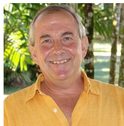
Director General Director General, SPREP

The Pacific Meteorological Desk Partnership is an integral component of the Secretariat of the Pacific Regional Environment Programme and resides with the Climate Change Division. The Pacific Meteorological Desk Partnership provides secretariat support to the Chairman of the Pacific Meteorological Council, the Pacific Meteorological Council and its members. The 2 nd Meeting of the Pacific Meteorological Council sets the foundation for the 'new perspective and look' of the Pacific Meteorological Services Directors after meeting for fourteenth sessions under the banner of the Regional Meteorological Services Directors. The Secretariat of the Pacific Regional Environment Programme is grateful to its members, donors, development partners, collaborating organizations and institutions for their continuous support to bring development to the National Meteorological Services in the Pacific region.