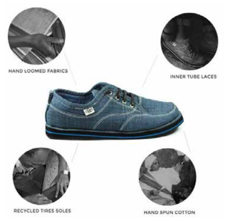
Sole Rebels manufactures shoes from recycled products and describes itself as "Green by Heritage"33

Sole Rebels<sup>32</sup> is an Ethiopian company that makes shoes from recycled materials.