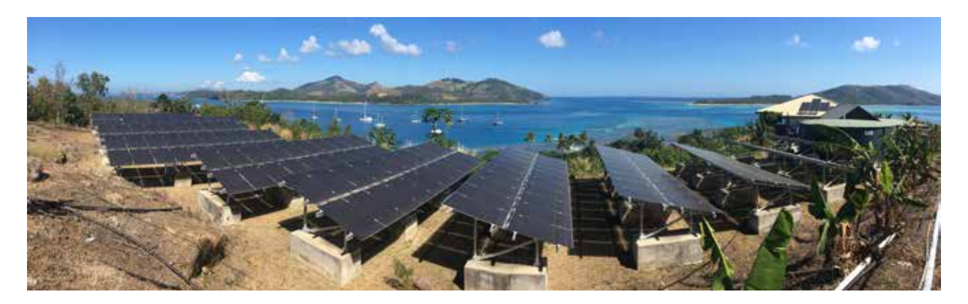
Nanuya Island Resort has a solar array of 260 panels providing electricity for their tourism property in the Yasawa Group^{27}