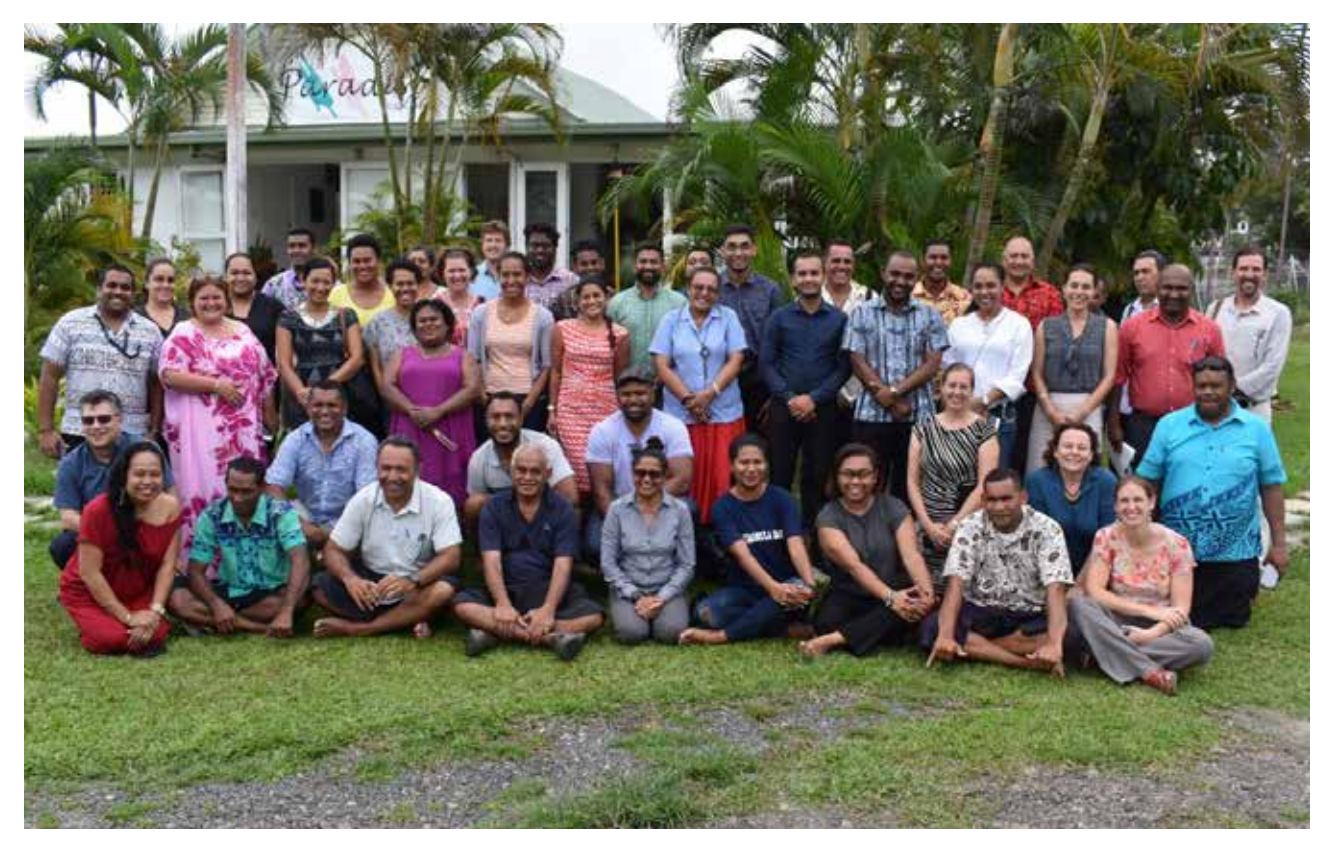
Group photo of participants at the Greenpreneurs Jumpstart your Green Business Workshop in Suva, Fiji, September 2018

In Fiji, the Greenpreneurs Jumpstart Your Green Business Workshop was held in September 2018, organised jointly with the Pacific Centre of Excellence for Renewable Energy and Energy Efficiency. Over twenty participants engaged with trainers and local business mentors to learn about trends in agriculture, waste, and energy; requirements for starting a business in the country; and examples of existing successful green businesses in Fiji and the Pacific region. This guide is based on the information covered in the workshop, and aims to assist other potential green entrepreneurs in developing new, innovative green business ideas that will help Fiji meet its environmental and developmental goals and ensure a clean, prosperous future for the country.