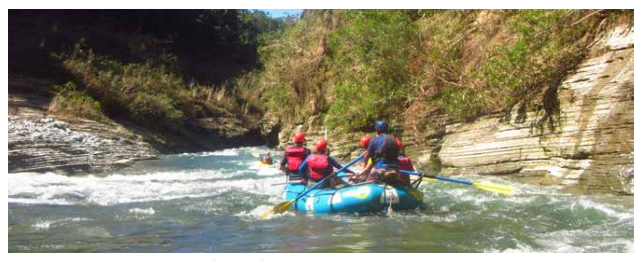
Rivers Fiji works with local landowners (mataqali) to protect the Upper Navua Conservation Area, Fiji's first Ramsar Site (a wetland site determined to have international importance)13

Rivers Fiji<sup>12</sup> is a tourism company offering rafting trips that has a conservation lease on the Upper Navua River.