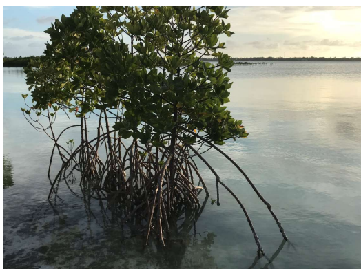
Figure 2. Rhizophora stylosa

The mangroves in South Tarawa are dominated by Rhizophora mucronata , with some Bruguiera gymnorhiza , Lumnitzera racemosa and Sonneratia alba (Scott, 1993). The mangroves in South Tarawa have been affected by a growing human population, including clearance for development and pollution (Spalding et al., 2010). The acute shortage of land has led to extensive reclamation of the lagoon foreshore and loss of mangroves, along with their exploitation for construction material (Scott, 1993; p. 205).