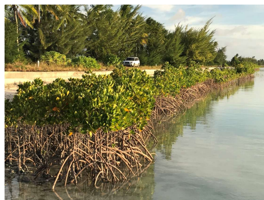
Figure 3. Rhizophora stylosa mangroves planted along the Ananau causeway (Tarawa)

There are growing efforts to restore and plant mangroves in Kiribati, including a project by the International Society for Mangrove Ecosystems, in association with local youth clubs and the government (MELAD), that has been planting mangroves in South Tarawa since 2005 as a means of reducing coastal erosion (Spalding et al., 2010; p.173; Baba et al., 2009; Baba, 2011).