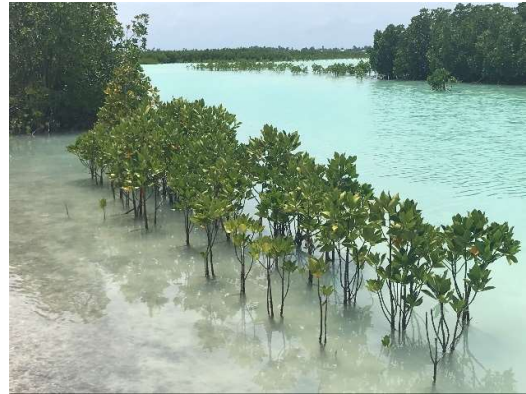
Figure 4. Recently planted saplings of Rhizophora stylosa on Tarawa (with some older stands in the background).

support from local community groups, and the potential benefits it would generate in protecting the island from the growing threat of sea level rise, there is scope for further mangrove planting in Tarawa (Kiribati).