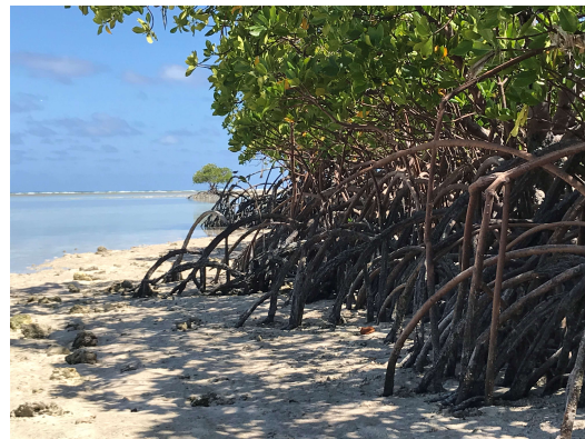
Figure 1. Natural mangrove stand in North Tarawa

These guidelines have been written for local government staff (e.g. from the Ministry of Fisheries or Environment), scientists and NGO's in the region, with the intention that they work in close collaboration with local communities to implement mangrove planting when and where that would considered appropriate.