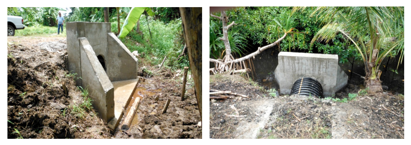
Figure 4. New culverts installed by the project.

The new road was completed and officially opened in May 2014.