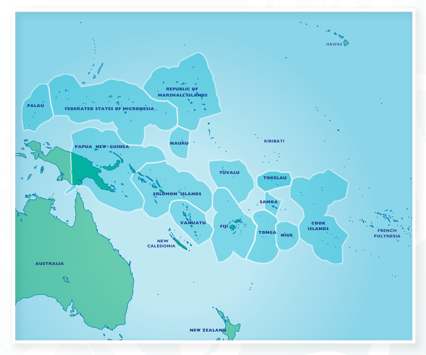
PACC – building adaptation capacity in 14 Pacific island countries and territories