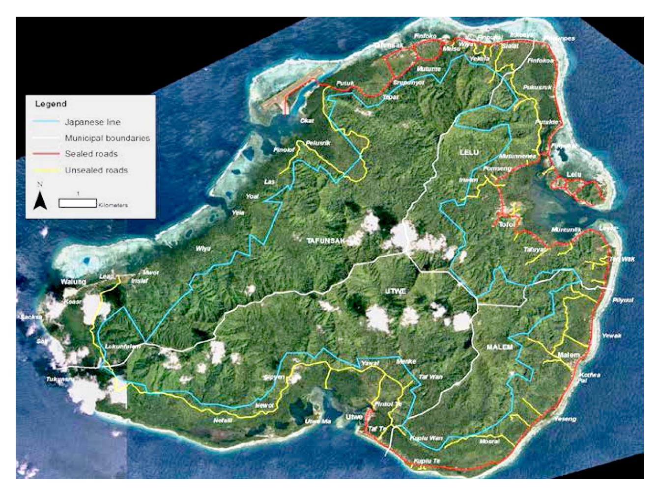
Figure 1. Map of Kosrae.

The population of approximately 8,247 (2000 census) is largely dependent upon fishing and farming for their livelihood. The major population centres are Lelu and Tafunsak. The economy is dominated by US Government grant funding and other external assistance with tourism (918 visitors in 2012) the only other significant foreign revenue earner.