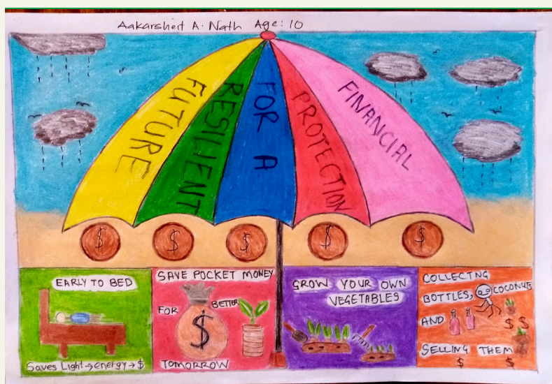
Aakarsheit Nath, Winner of the 6-10 years old Category

A total of 28 emerging youth artists, poets, and filmmakers from across the Blue Pacific have been recognised in creative competition documenting key messages and raising awareness on disaster risk financing (DRF).