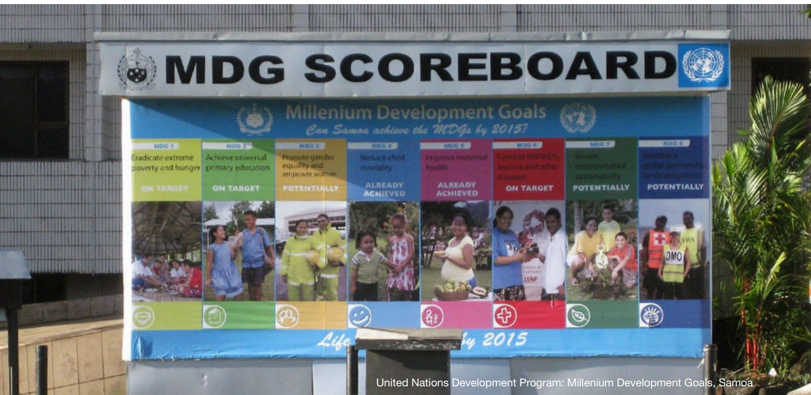
United Nations Development Program: Millenium Development Goals, Samoa