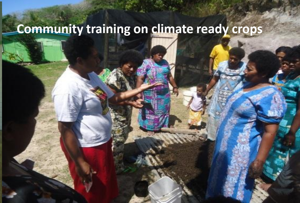
Community training on climate ready crops