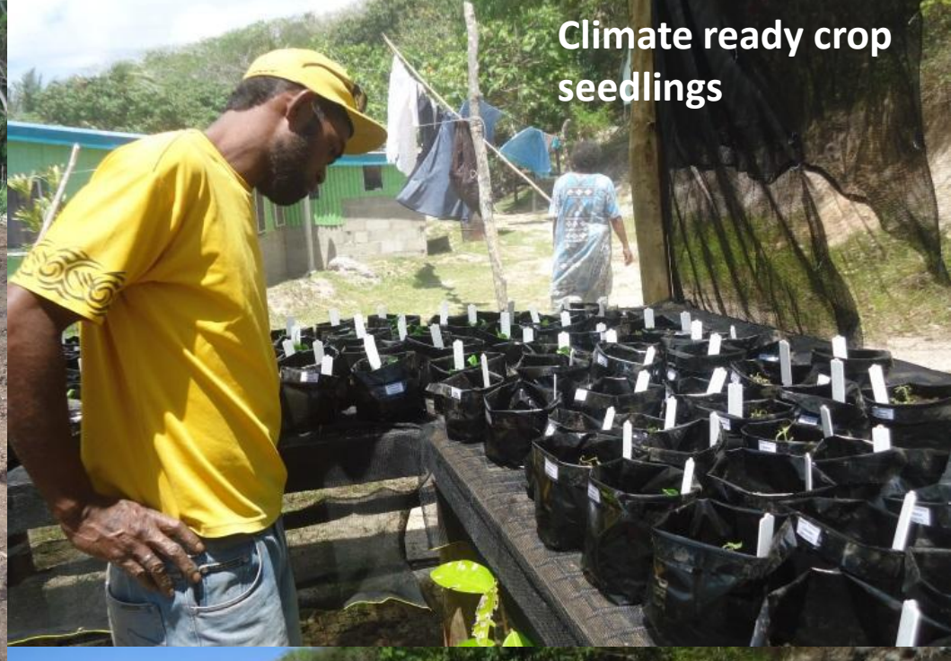
Climate ready crop seedlings