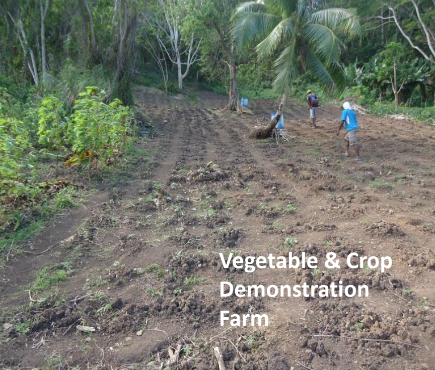
Vegetable & Crop Demonstration Farm