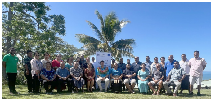
Figure 3. Country officers participate in a 10-day training on the use of the impacts Methodology.

With the experiential learning to scale up its use, the iA Methodology is about learning from the past to make sense of how interventions attribute to building community resilience.