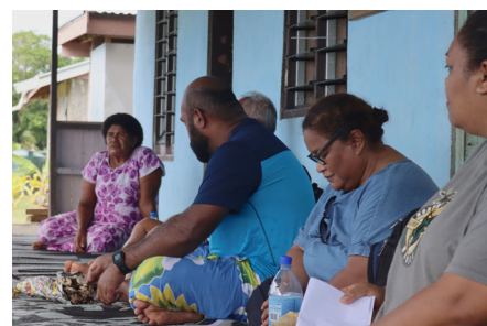
Photos from the Regional training: GIS training (left), Talanoa sessions (top right) and Field trip to Nacula Island (bottom right).