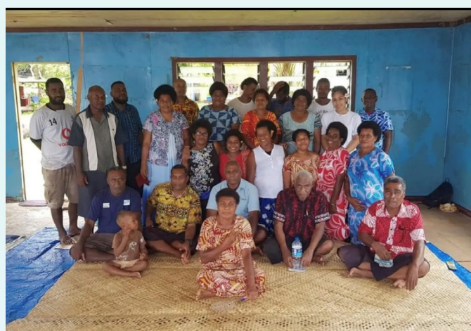
Figure 2. WWF Fiji collaborate with SPREP to carry out a community social impact assessment on Mali Island.