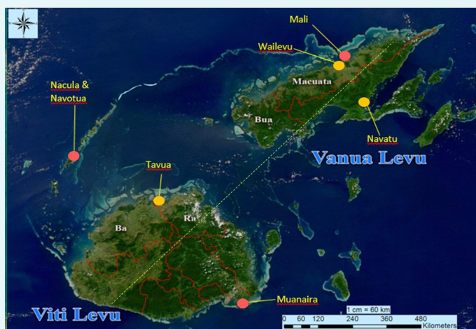
Figure 1. Light version of iA methodology applied in assisted and non-assisted areas with adaptation interventions.

The World Wide Fund for Nature (WWF) Fiji partnered with SPREP to undertake assessments across a range of community sites.