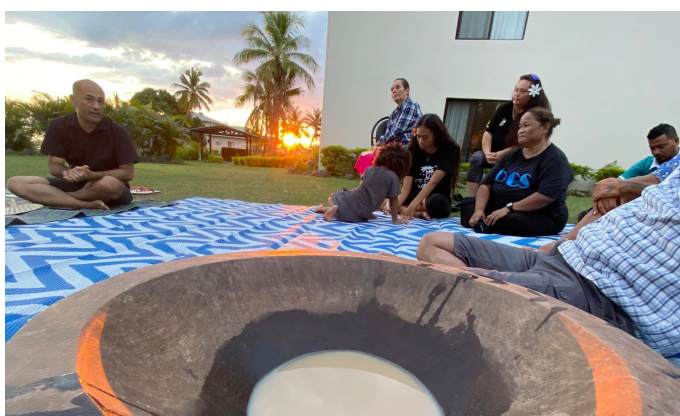
Figure 4. Country officers participate in Talanoa sessions centred around country experiences and reflections on the use of the impacts Methodology.